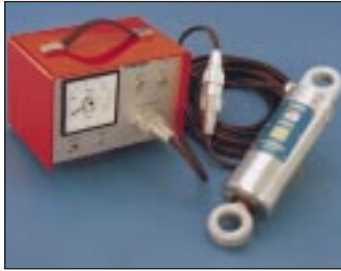
PIAB Dynamometer with portable Readout Instrument type 6:14.