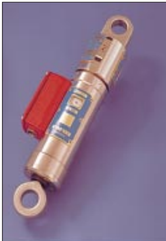
PIAB Dynamometer with built-on contact head.