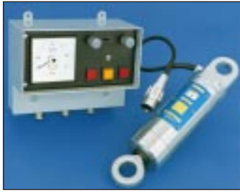
PIAB Dynamometer with Readout Instrument type 6:64 with two contact functions.